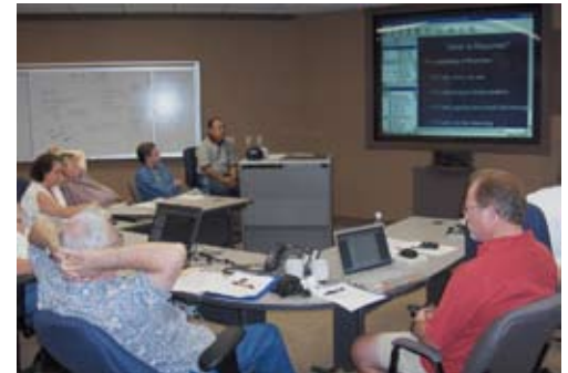
District Rotarians from El Paso gather around the big screen hookup for the September 16th Membership Assembly