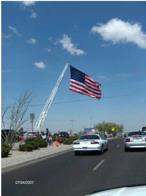
Above: Scene from the 2007 Parade