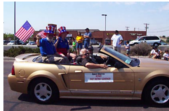
West El Paso Rotarians In 2002 July 4th Parade