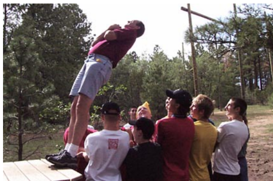
Rotarian camp counselor participating in trust building exercise with RYLA Campers