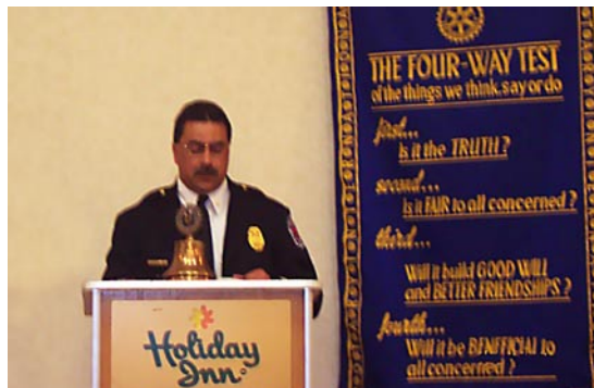
Rotary Club of West El Paso Police Officer of the Year